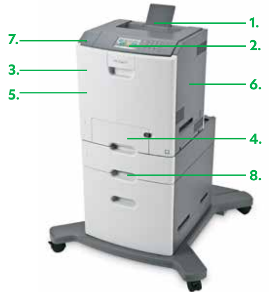
Lexmark CS748de color laser printer shown with the optional 550-sheet drawer, 2,000-sheet high capacity feeder and caster base.

Operate your printer with ease and confidence using the 4.3-inch (10.9 cm) color touch screen that makes navigation smart and intuitive.